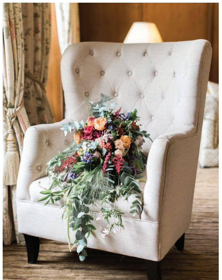
OPPOSITE PAGE Dress and flower crown As before THIS PAGE Clockwise from top left Stationery, dress, flowers and chair signs As before