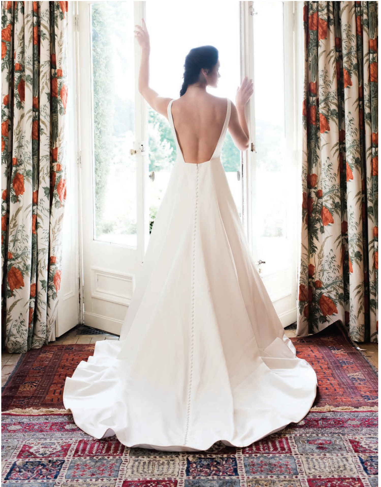
THIS PAGE Dress Belladonna Bridal OPPOSITE PAGE Dress Alice May Bridal