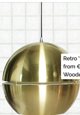
Retro '70 pendant lamp, from €189, Woo Design, Woodesign.ie