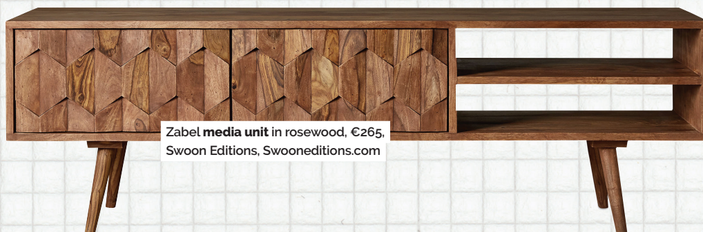
Zabel media unit in rosewood, €265, Swoon Editions, Swooneditions.com