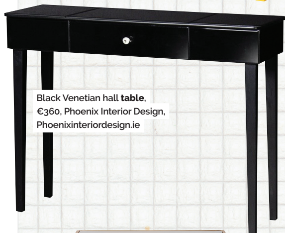
Black Venetian hall table, €360, Phoenix Interior Design, Phoenixinteriordesign.ie