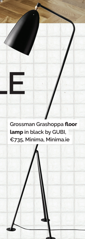
Grossman Grashoppa floor lamp in black by GUBI, €735, Minima, Minima.ie

Through signature pieces, this stylish couple's Smithfield home balances simplicity and charm, seamlessly