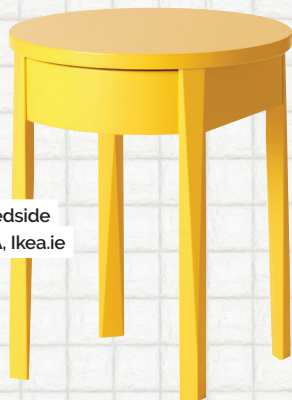
STOCKHOLM bedside table, €80, IKEA, Ikea.ie