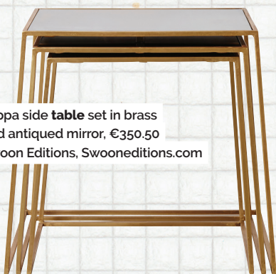
Tappa side table set in brass and antiqued mirror, €350.50 Swoon Editions, Swooneditions.com