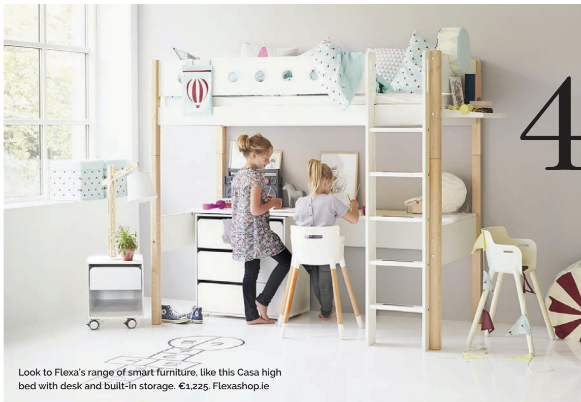
Look to Flexa's range of smart furniture, like this Casa high bed with desk and built-in storage. €1,225. Flexashop.ie