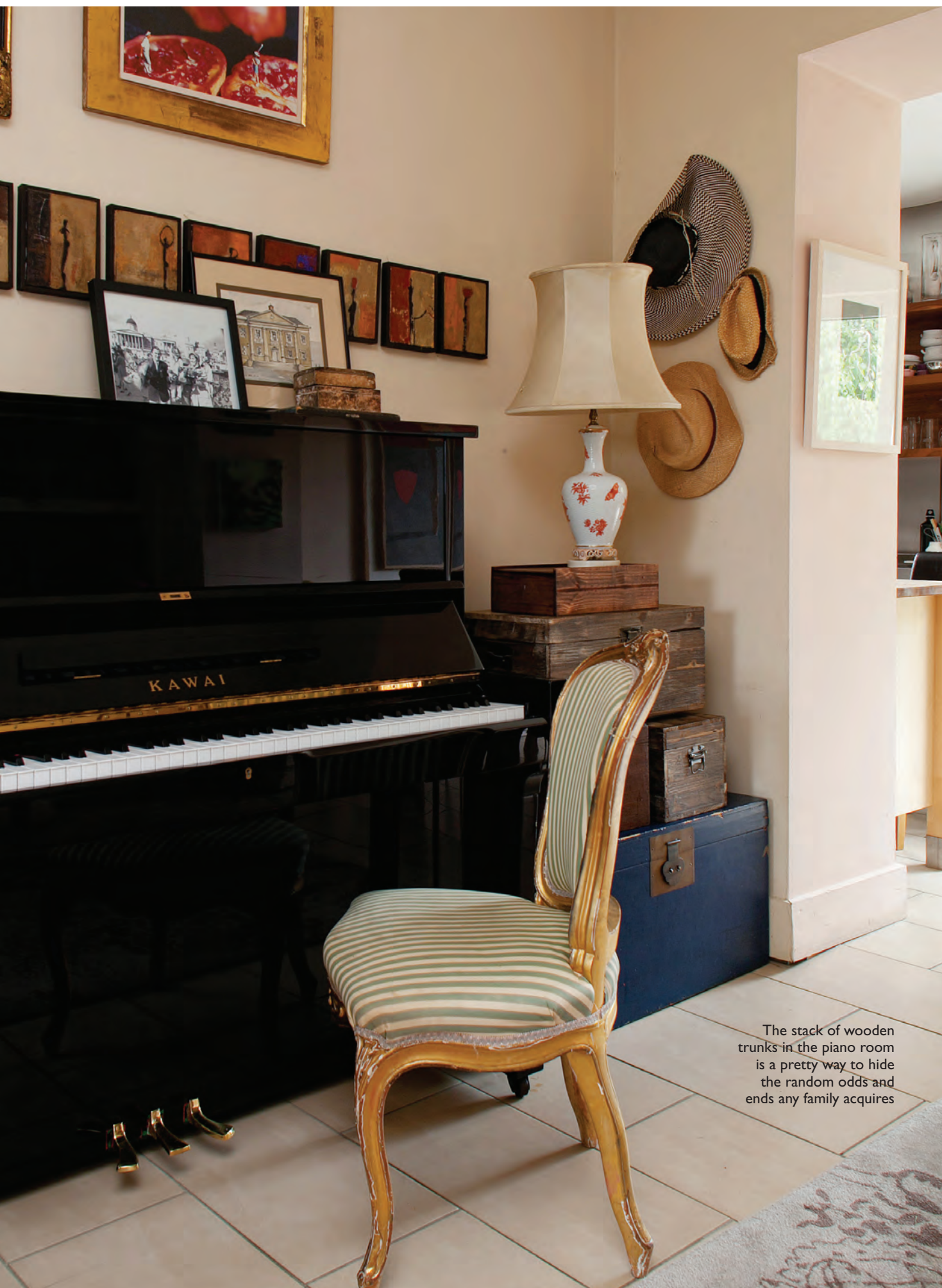
The stack of wooden trunks in the piano room is a pretty way to hide the random odds and ends any family acquires