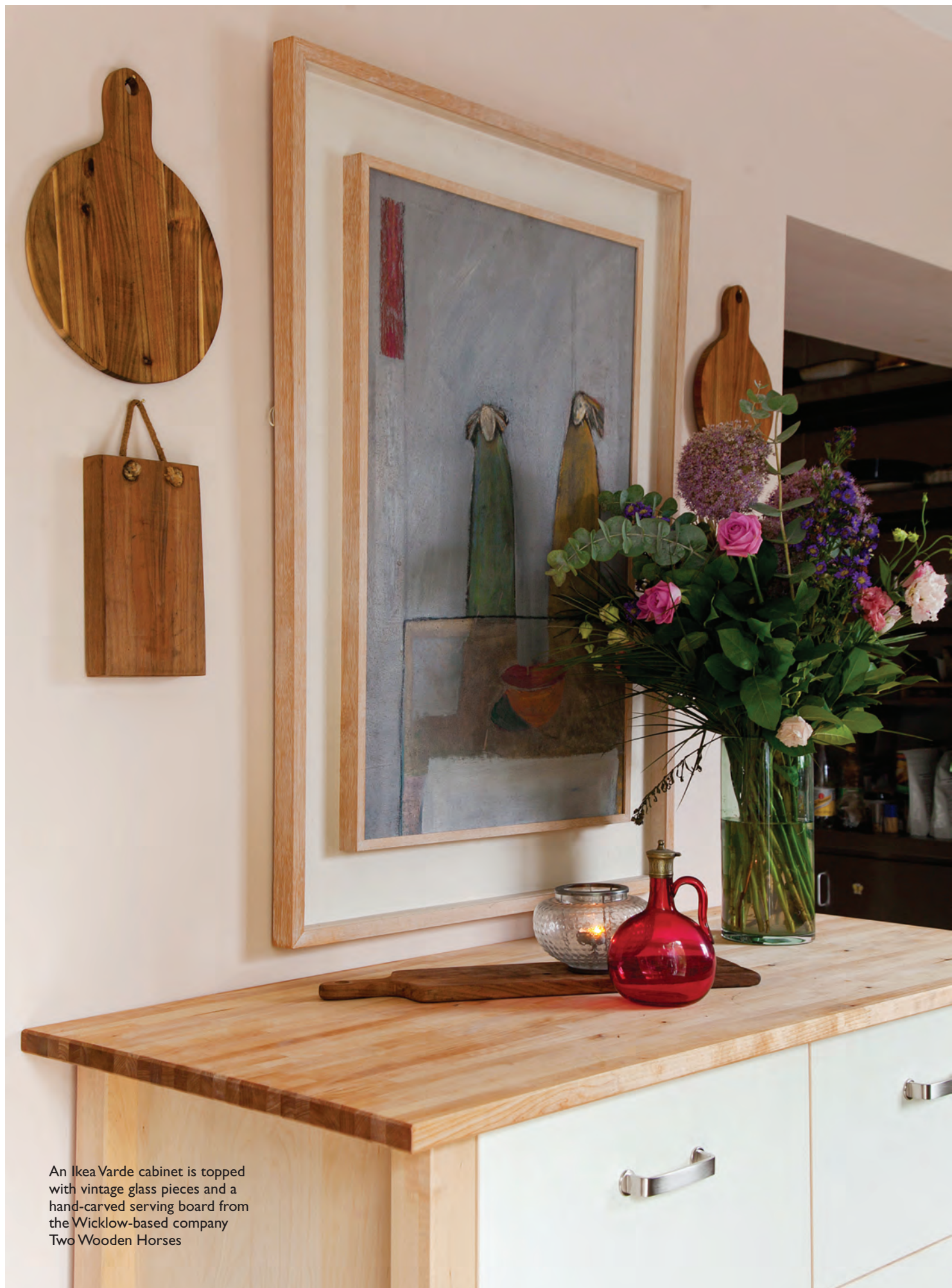
An Ikea Varde cabinet is topped with vintage glass pieces and a hand-carved serving board from the Wicklow-based company Two Wooden Horses