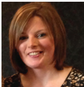
CLARE OF CRAZY DAISY

Tonleeg Road, Dublin 5 btobflowers.ie E: info@btobflowers.ie T: 086 101 8390