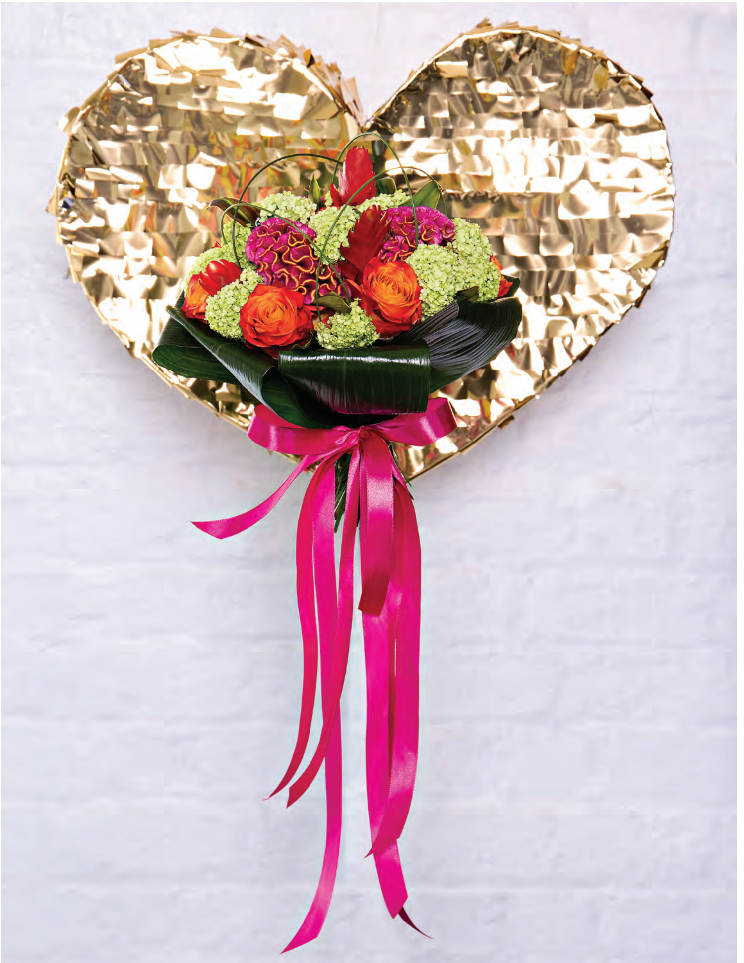
THIS PAGE April Flowers, aprilflowers.ie OPPOSITE PAGE Celine's Flowers, irishflowershops.com