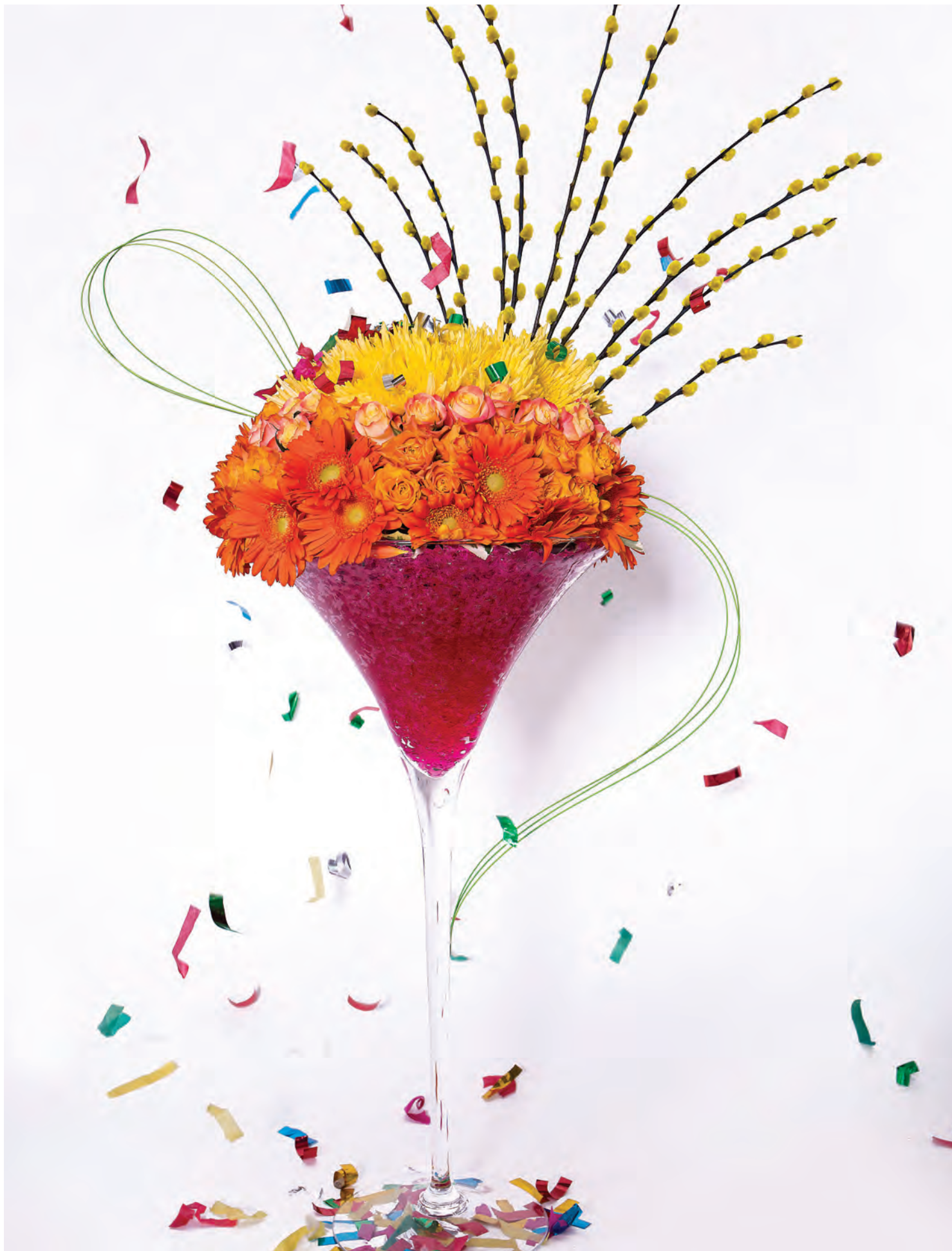
THIS PAGE Buds to Blooms, btobflowers.ie OPPOSITE PAGE Main St Flowers, mainstreetflowers.ie