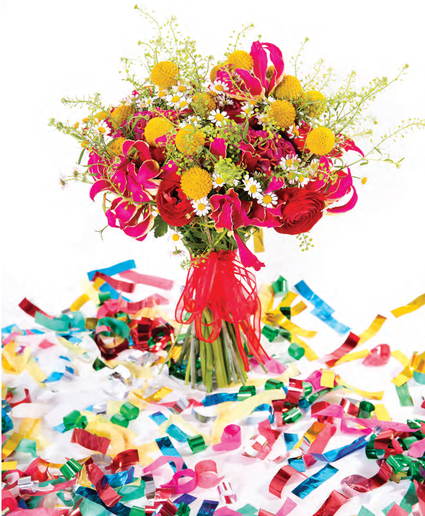
THIS PAGE Dundrum Blooms, dundrumblooms.ie OPPOSITE PAGE Crazy Daisy, crazydaisy.ie