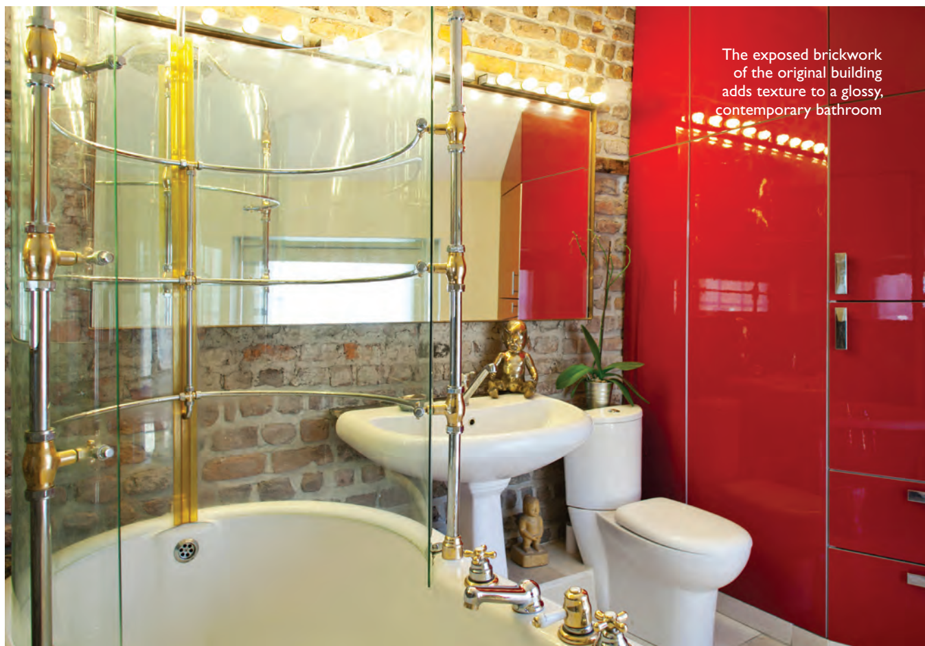
The exposed brickwork of the original building adds texture to a glossy, contemporary bathroom