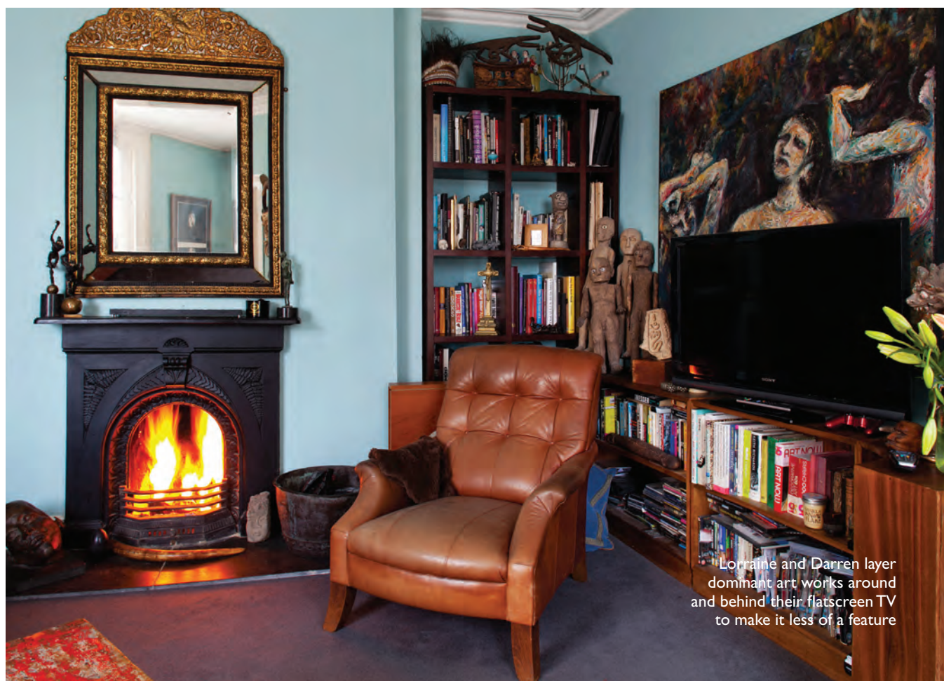
Lorraine and Darren layer dominant art works around and behind their flatscreen TV to make it less of a feature