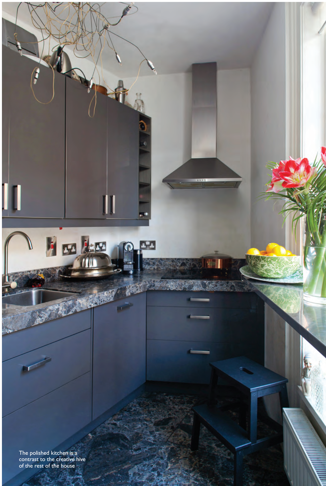
The polished kitchen is a contrast to the creative hive of the rest of the house